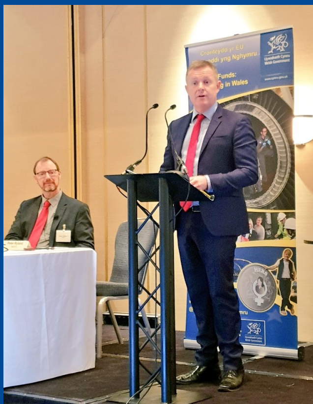
Jeremy Miles AM, Counsel General & Brexit Minister