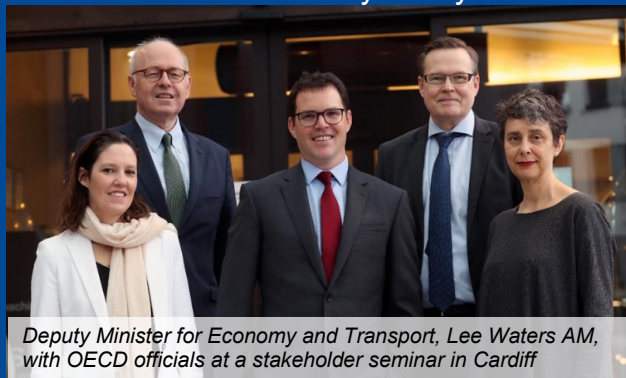
Deputy Minister for Economy and Transport, Lee Waters AM, with OECD officials at a stakeholder seminar in Cardiff

A two-year project with the OECD has also been underway since January to help ensure international best practice and effective regional governance are built into our future plans. The OECD visited Wales in June to gather feedback from Government and stakeholders and visited Wales again 25-29 November to inform their work and broaden engagement. This included an OECD seminar which brought together the Welsh Government, non-government stakeholders and international peers and practitioners to exchange information and expertise. Work will continue throughout 2020.