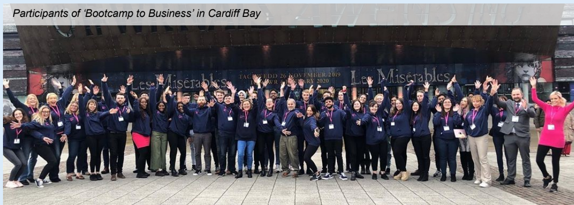
Participants of 'Bootcamp to Business' in Cardiff Bay

Big Ideas Wales is part funded by the European Regional Development Fund through the Welsh Government