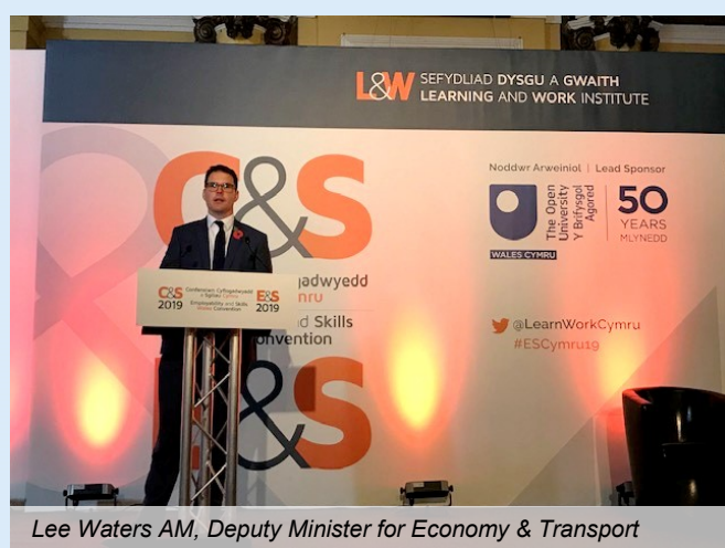
Lee Waters AM, Deputy Minister for Economy & Transport

We were delighted to be asked to facilitate a workshop at the Employability and Skills Wales Convention held by the Learning and Work Institute (LWI). The event was held in City Hall, Cardiff, with a fantastic range of presentations and workshops.